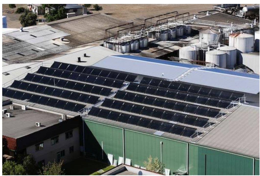
De Bortoli Wines Australia

For those of you who only know solar energy as Photovoltaics (PV) there is another solar technology that has the potential to significantly reduce Green-House-Gas emissions often referred to as the other solar "White Meat" basically ignored by most of the State and DOE, Federal Energy and R&D programs except Solar Thermal Electric Generation (CSP). Common uses of the other white meat or I should say the other solar technology include: swimming pool heating, boiler water preheating, domestic water and space heating, air conditioning, and high temperature heat for a wide range of commercial and industrial processes such as Industrial Process Heat (IPH).