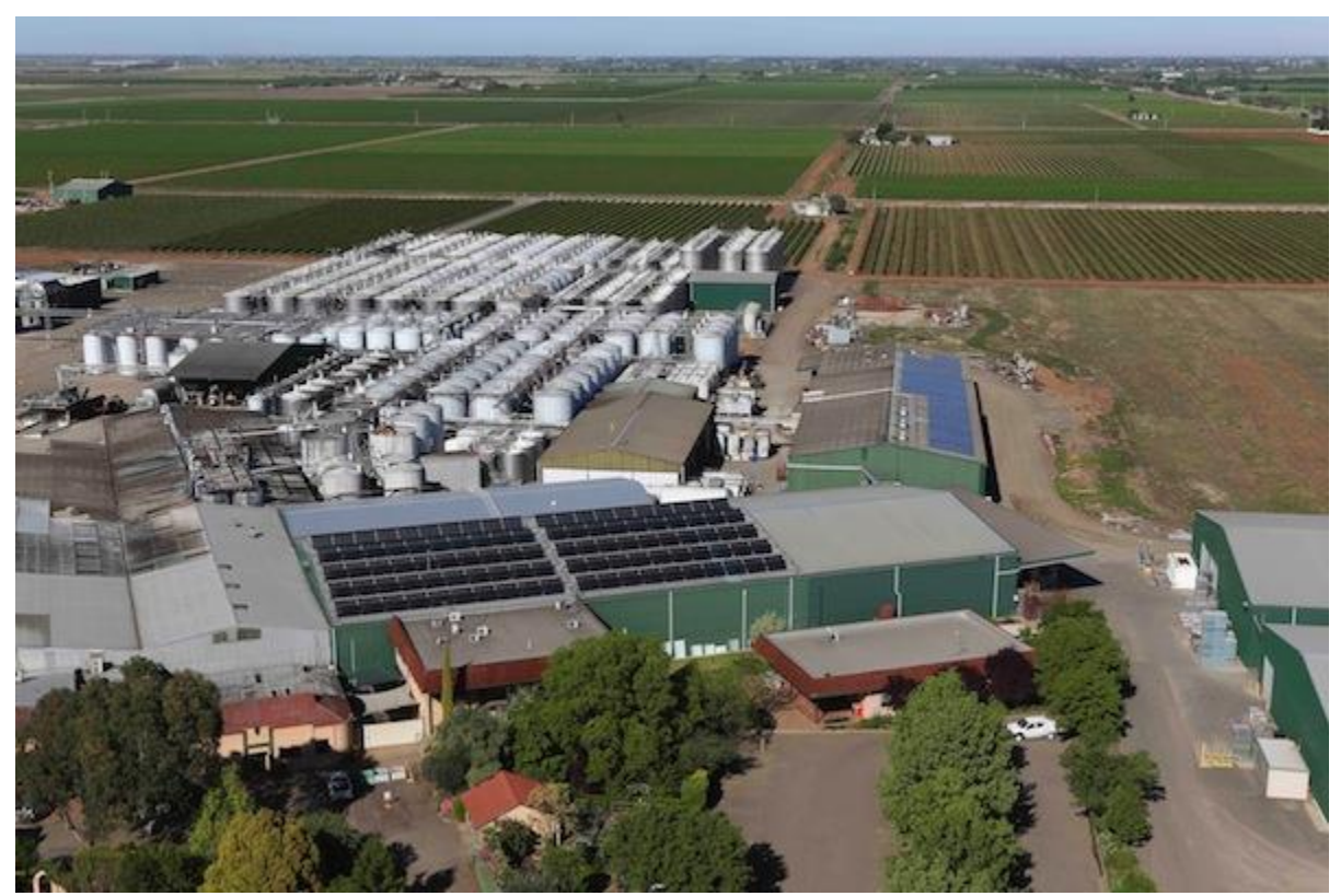
De Bortoli Wines Australia

The report also states "After significant interest in the 1970s, but relatively few deployments, the use of solar technologies for thermal applications, including enhanced oil recovery (EOR), desalination, and industrial process heat (IPH), is again receiving global interest. In particular, the European Union (EU) has been a leader in the use, development, deployment, and tracking of Solar Industrial Process Heat (SIPH) plants.