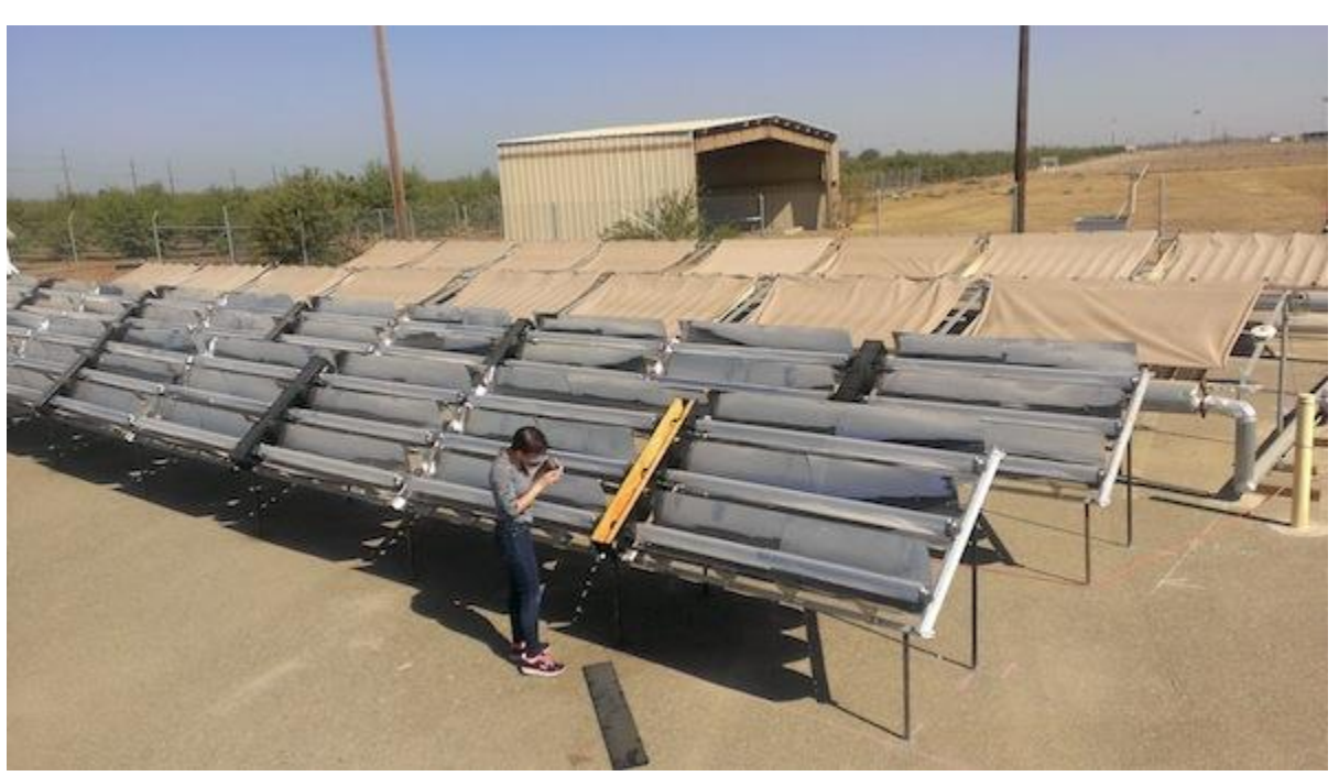
UC Merced XCPC array

The California Energy Commission, again leading the way to Energy Independence, Renewable Energy and Energy Efficiency to reduce carbon emissions has issued a RFP for Advanced Water Heating System Demonstrations, Advanced HVAC and Building Envelope Demonstrations, Integrated Natural Gas System Demonstrations, and Applied Research Strategies for Appliances, Zero Net Energy Buildings, and Codes and Standards.