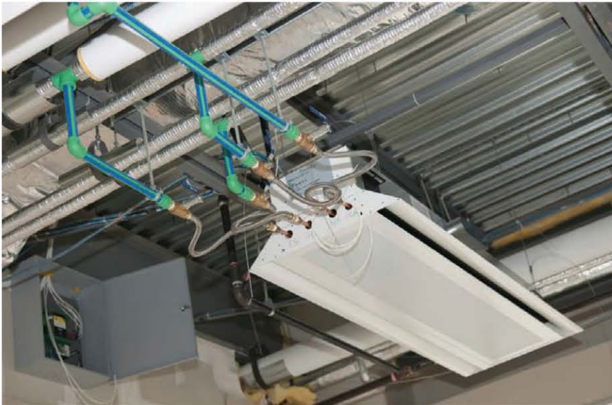
Example of a chilled beam.

The world we live in would not be the same if air conditioning weren't available. Entire regions of the world would have remained undeveloped, sustaining minimal populations, if air conditioning hadn't become a part of our lives.