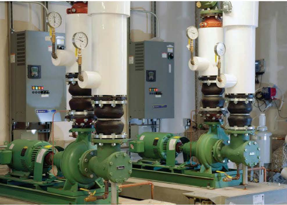
An example of installed variable-speed drives.

recognized this and set limits on the amount of refrigerant that can be discharged into a room to protect the occupants.