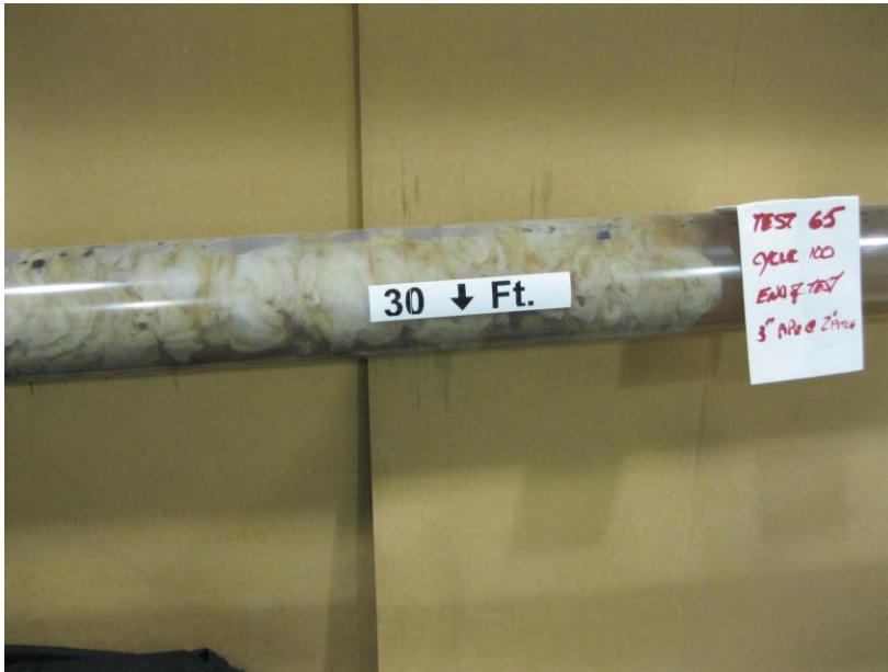
Photo 4 – Toilet paper bunches up to block airflow in 3-inch-diameter pipe.