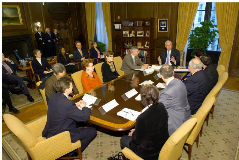
Photo 1 – PERC representatives meet at EPA headquarters with then-Administrator Stephen Johnson in December 2008 to sign the Memorandum of Understanding forming PERC.

This article provides only a glimpse into the PERC research and cannot substitute for reading the full PERC reports should you wish to have a full understanding of the research. If you would like to read the full reports, they may be downloaded for free at www.plumbingefficiencyresearchcoalition.org .